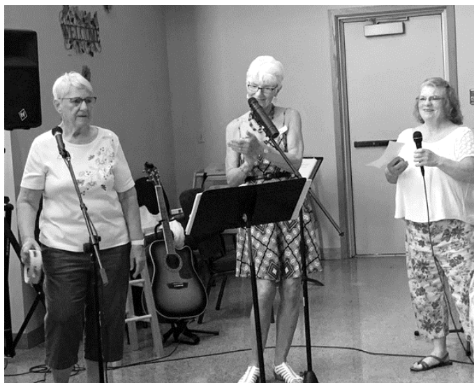
July's Young @ Heart Photos